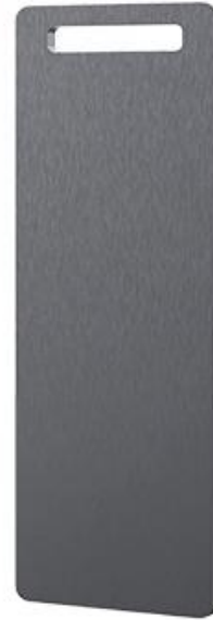
Back Board PL-30136