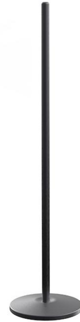
Floor Stand PL-30130/PL-30131