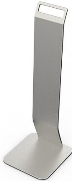
Table Holder PT-M49H