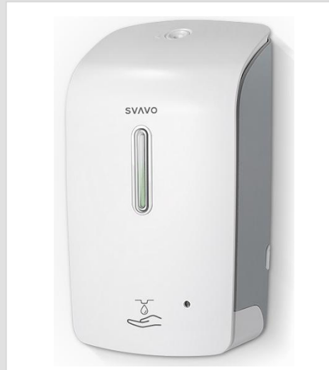
PL-151055 Vol: 1000ml Gel Type